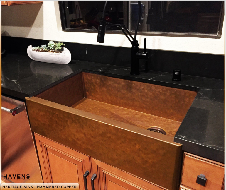
HERITAGE FARMHOUSE COPPER SINK | HERITAGE SINK | HAMMERED COPPER

LIFETIME WARRANTY | EASY CARE | ERGONOMIC DESIGN | ANTIMICROBIAL SURFACE