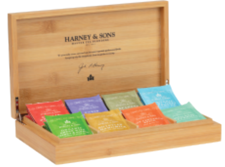
8 slot Natural Bamboo Tea Bag Chest 64-7031-1