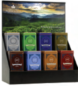
8 slot Metal Tin & Wrapped Sachet Rack 91005 66-7073-1