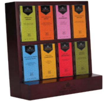
8 slot Wooden Rack Premium Tea Bags 91011 66-7071-6