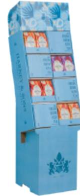
64x3ct Iced Tea Carton Shipper 10233 69-3821-05