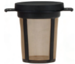
Permanent Tea Filter 06250 Medium Case of 12 Filters 06251 Large Case of 6 Filters