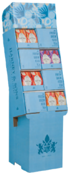
64x3ct Iced Tea Carton Shipper 10233 69-3821-05