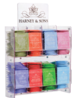
8 slot Lucite Rack for Tea Bags 91009 66-7071-5