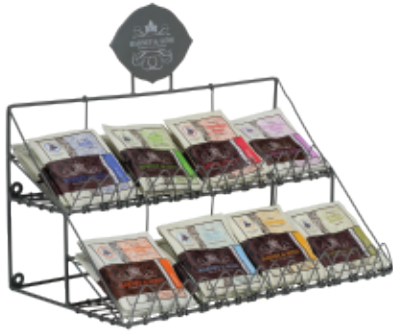
8 slot Tin & Wrapped Sachet Rack 91005 66-7073-1