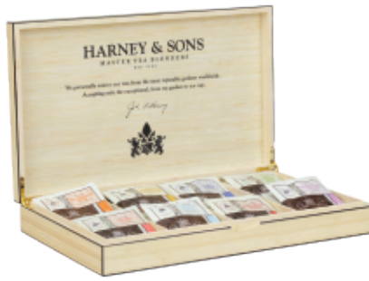
8 slot Heirloom Wrapped Chest 00711 Bamboo