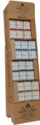
48x20ct Holiday Shipper 69-3821-2