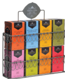
8 slot Premium Tea Bag Rack 91004 66-7071-2