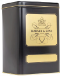
Tea Storage Canister 00011 3lb. Tea Tin