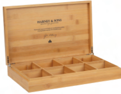
8 Slot Natural Bamboo Wrapped Sachet Chest 64-7032-10