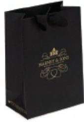
H&S Shopping Bag 99999 Large Bag 99998 Medium Bag 99997 Small Bag