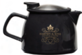
Harney & Sons Bell Teapot 46-7394-2 16oz with infuser