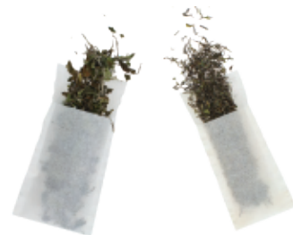
Finum Paper Filters 06140 Large (2,400 per case) 06150 X-Large (2,100 per case)