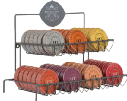
7 slot Tagalong Rack 91006 66-7074-1