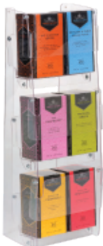
6 slot Lucite Rack for Premiums 91014 66-7071-3