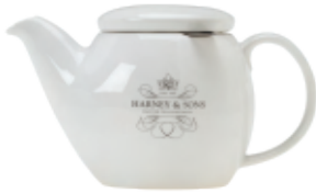
Harney & Sons Teapot 00262 16oz with infuser 00261 16oz without infuser