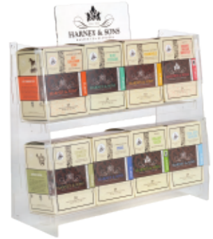
8 slot Lucite Rack for Wrapped Sachets 91007 66-7072-1