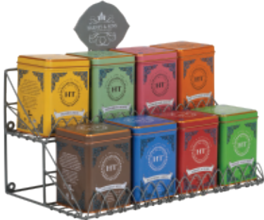
8 slot Tin & Wrapped Sachet Rack 91005 66-7073-1