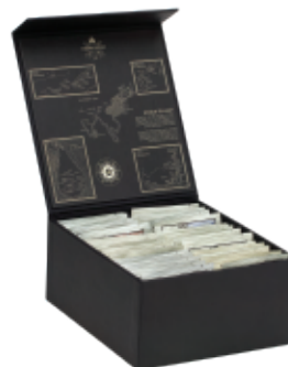
6 slot Heritage Wrapped Sachet Chest 00507 64-7032-6