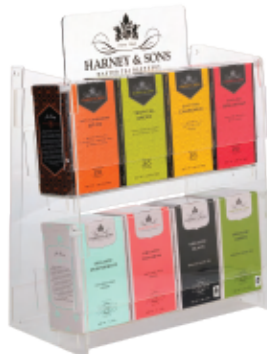
8 slot Lucite Rack for Premiums 91008 66-7071-4