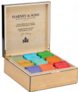
9 slot Heirloom Tea Bag Chest Black/Bamboo 01010 64-7031-3 Taupe 01011 64-7031-4