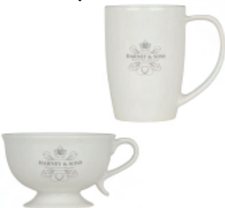
Harney & Sons Teaware 00009 Mug with Infuser 00621 Mug 04191 Cup