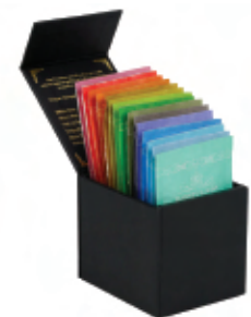
1 slot Chest with Magnetic Closure 64-7031-5 Tea Bag 64-7032-3 Wrapped Sachet