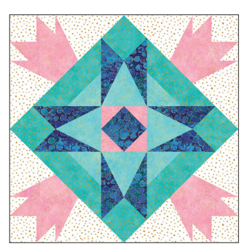
BlockBusters #84: Leapfrog