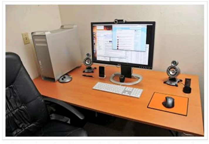
Just look at how the white on the keyboard matches the white on the screen.

This picture just doesn't do the Bluemax Full Spectrum lights justice. You probably won't be able to tell from just the image, but it was taken with white balance set to 5500K (Pure Daylight). These lights are amazing. I've had major issues with fluorescent lights in the past, and I'm glad that someone has finally solved the fluorescent problem: Bluemax.