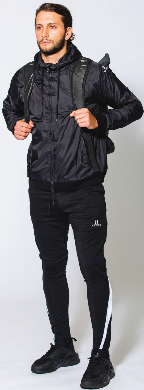
NEW Z-ZIP BAG PG 9