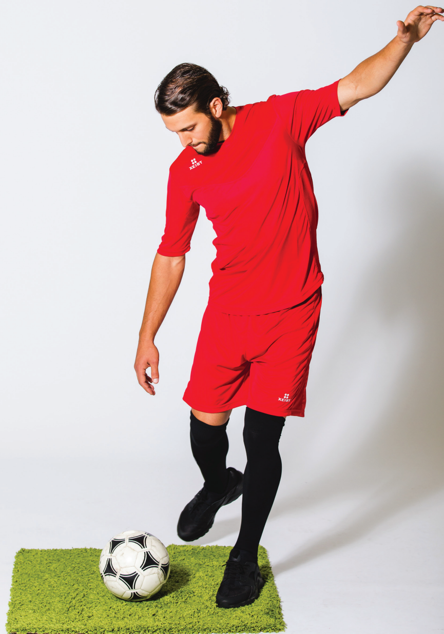
NEW MAGNA JERSEY PG 2