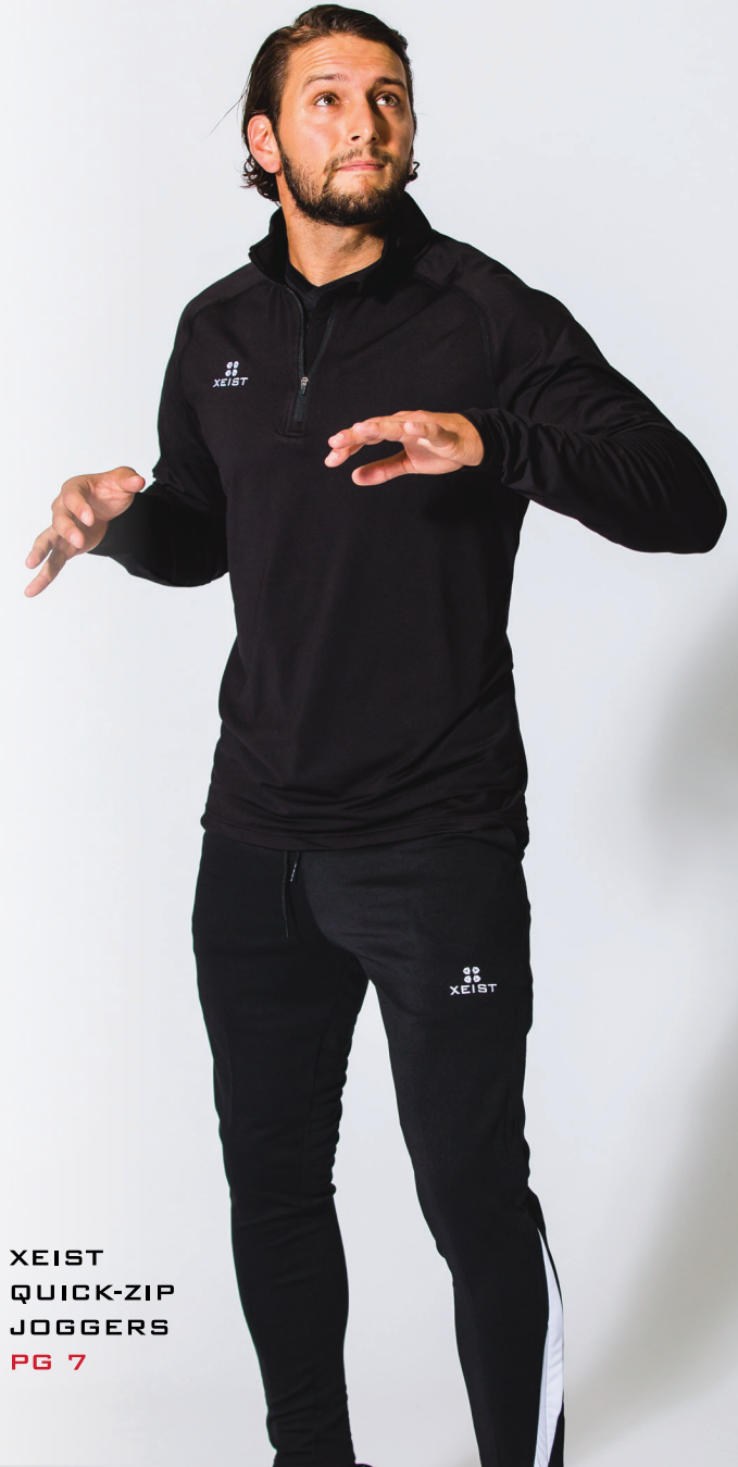
XEIST QUICK-ZIP JOGGERS PG 7