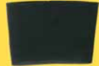
19-1600 Foam filter

Fit for 3gal (SL18123P) and 2.5 - 5gal w/o blower function