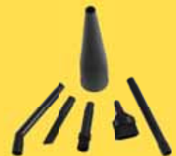
13-1584 Micro cleaning kit