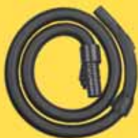
13-1504 1-1/4" x6' hose Fit for 6-8gal (SL18017,SL18016,SL18017 only)