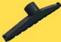
19-1900 1-7/8" x 10" floor nozzle