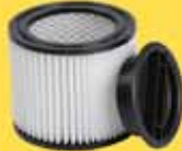
08-2551 Cartridge filter Fit for 2.5 - 5gal w/blower function (except SL18123P,SL18143, SL18115,SL18115P)