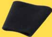
25-1202 Foam filter

Fit for Bucket head and 2.5 - 5gal with blower function(except SL18123P, SL18143,SL18115,SL18115P)