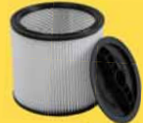
08-2566B Cartridge filter w/cap Fit for 5-18gal (except SL18138,SL18017P, SL18016,SL18017)