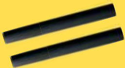
08-2502 2-1/2" x 1.6' extension wand