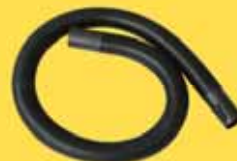
08-2536 2-1/2" x 6' hose Fit for 10 - 18gal w/quick lock port only