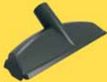
13-1570 1-1/4" x 10" floor nozzle