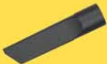
08-2506 2-1/2" crevice nozzle