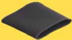
20-1200A Foam filter

Fit for Bucket head and 2.5 - 5gal with blower function(except SL18123P, SL18143,SL18115,SL18115P)