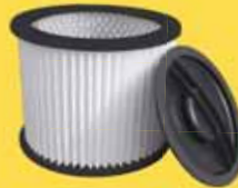
19-1800 Cartridge filter w/cap Fit for 6-8gal (SL18017P,SL18016, SL18017 only)