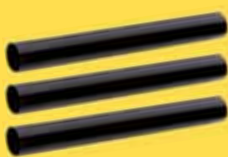
25-1205A 1-1/4" x 1' extension wand