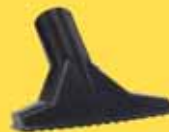
13-1588 1-1/4" gulper nozzle