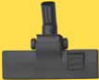
13-1505A 1-1/4" floor brush