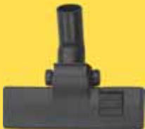
19-2300 1-7/8" floor Brush