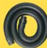
08-2526 2-1/2" x 7' hose Fit for 14 - 18gal w/thread lock port only