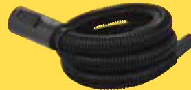
13-3300 1-1/4" x6' hose Fit for 5 - 12gal w/1-7/8" vacuum port only