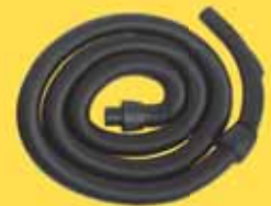
25-1218 1-1/4" x20' flexible hose Fit for 3.5-5gal wall-mount vac