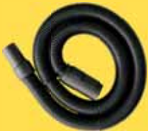
19-1100 Fit for 6-18gal w/1-7/8" vacuum port only