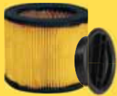
08-2550 Cartridge filter (dry only) Fit for 2.5 - 5gal w/blower function (except SL18123P,SL18143, SL18115,SL18115P)