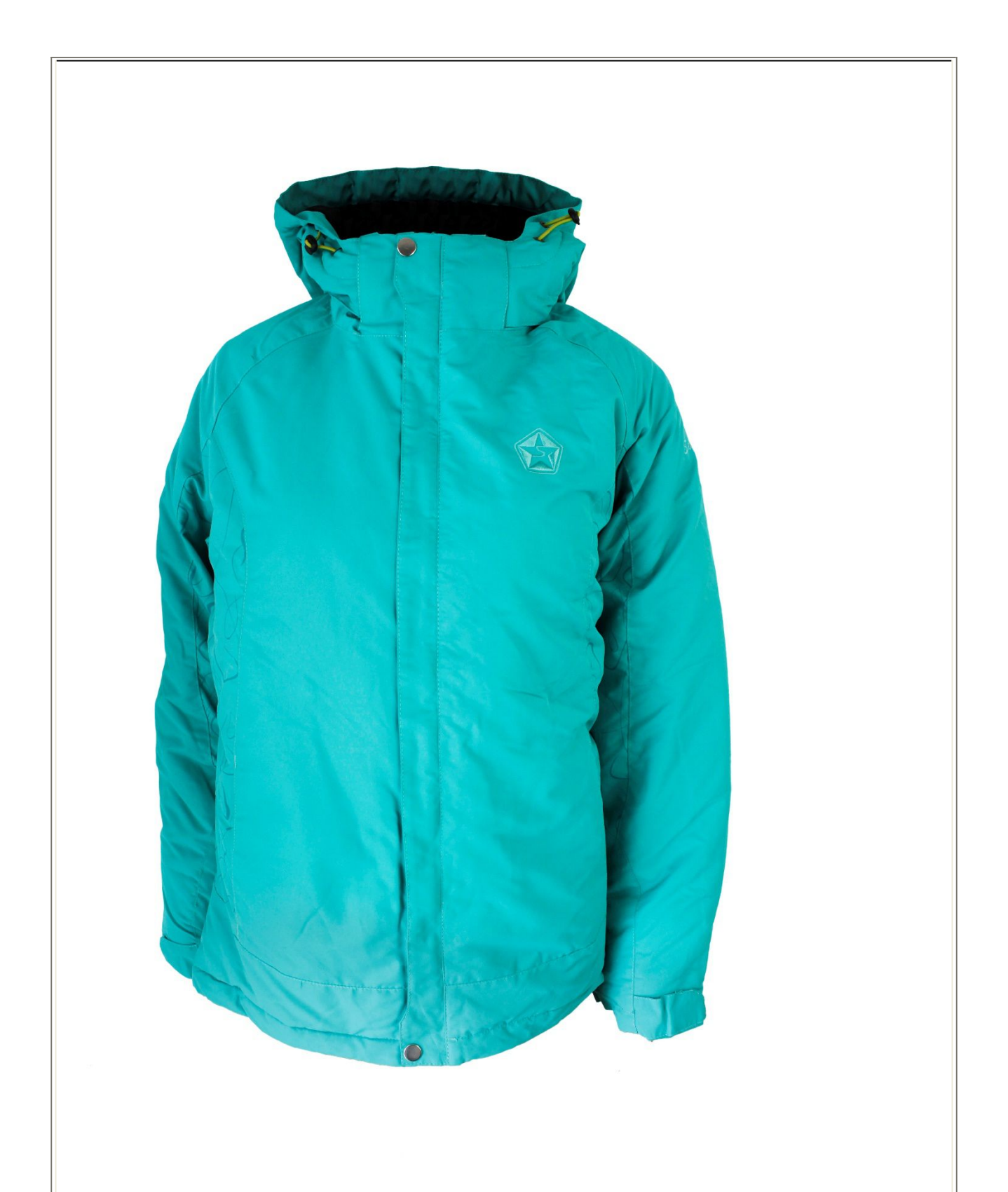
Image 3. Winner College Uniform – Boys jacket with hood drawstring and toggle.