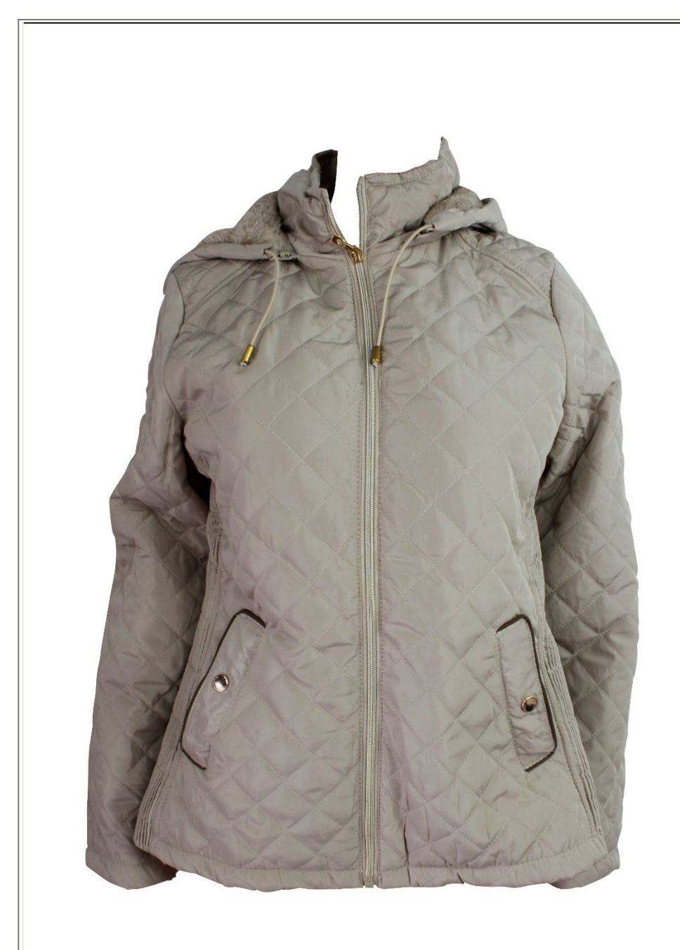
Image\ 2.\ Snow\ Bean\ -\ Girls\ jacket\ with\ hood\ drawstring\ and\ toggle.