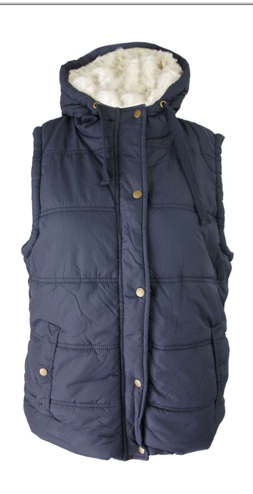
Image 5. Unknown Brand – Boys puffer jacket with hood drawstring and toggle.