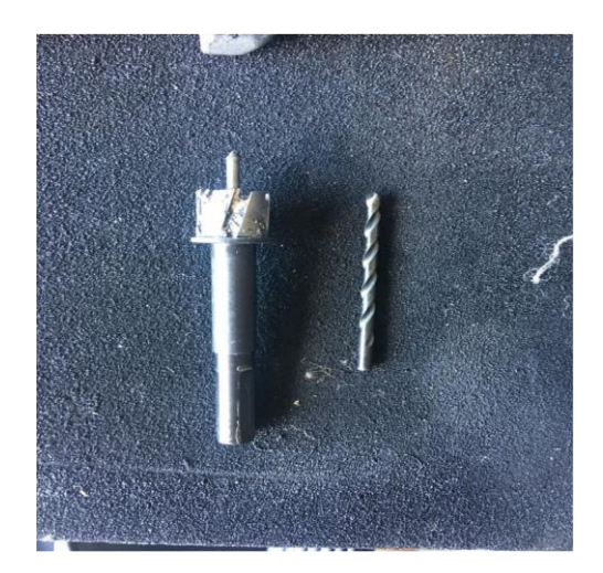
11/16" ROTOBROACH (Can be found on amazon)