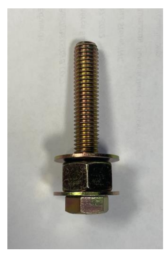
Frame insert tool

Included in this system are frame inserts. These inserts work well only if the pre-drilling is done correctly. Using an 11/16" drill or roto broach, drill existing hole that is lined up with the mount in the center of the bracket, then drill new hole in the other oval in the center of the bracket, remove bracket, (do not use "something close" because it will not work correctly)!