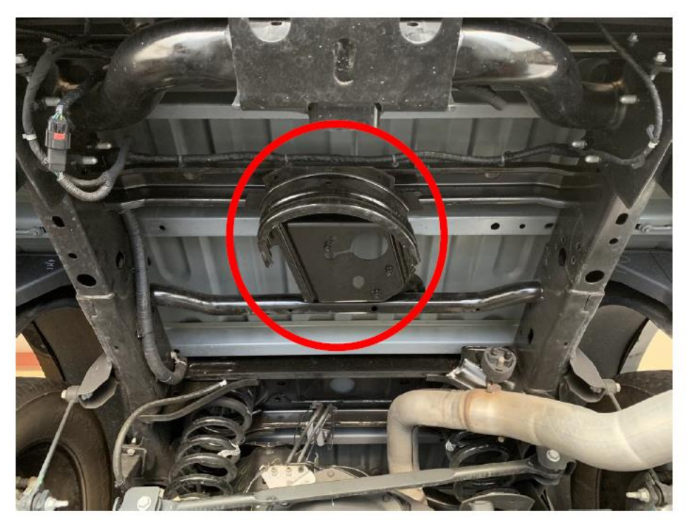
Cut down half circle as far as you can Using a sawzall or cutoff wheel.

Remove spare tire Remove heatshield Remove spare tire crank assembly