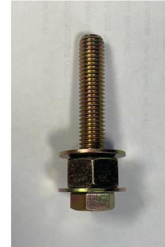
Frame insert tool

Included in this system are frame inserts. These inserts work well only if the pre-drilling is done correctly. Using an 11/16" drill or roto broach, drill existing hole that is lined up with the mount in the center of the bracket, then drill new hole in the other oval in the center of the bracket, remove bracket, (do not use "something close" because it will not work correctly)!