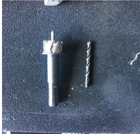
11/16" ROTOBROACH (Can be found on amazon)