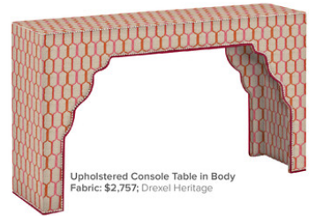
Upholstered Console Table in Body Fabric: $2,757; Drexel Heritage

D rexel Heritage's furnishings—offered in an array of fabrics, textiles, and trimmings—empower customers to fully customize the company's solid-wood designs to suit their tastes. This upholstered console table is no exception: depending on the details selected, it's capable of serving as a stand-alone piece or playing a demure supporting role.