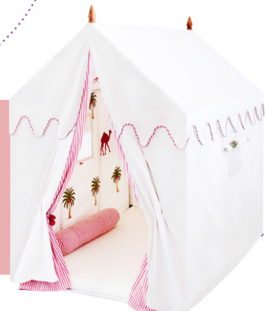
Mini Mughal Tent: $1,200; Mela & Roam

This hand-printed tent by fabric maker Mela & Roam—featuring raspberry stripes, palm trees, and two roll-up window shades—is crafted of organic cotton, making it the perfect refuge for children at play.