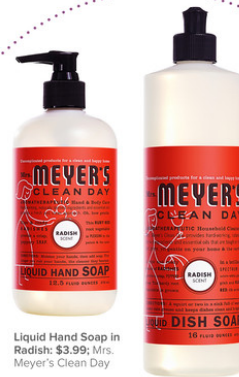
Liquid Hand Soap in Radish: $3.99; Mrs. Meyer's Clean Day