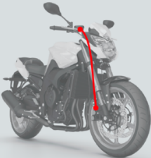
1 LINE FRONT