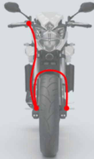
2 LINE HOP OVER