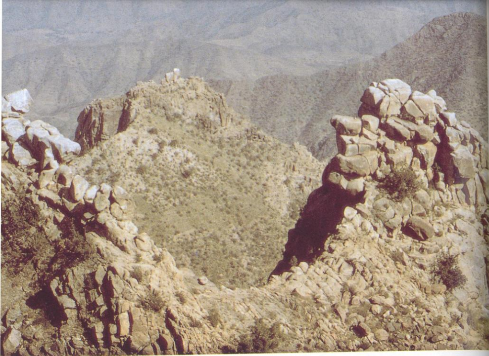
↑ Hills in the Southwestern Region