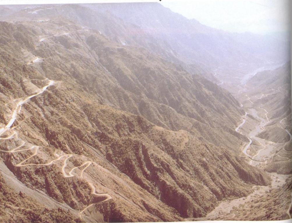
↓ of the Mountains of Southern Hijaz (Al-Baha)