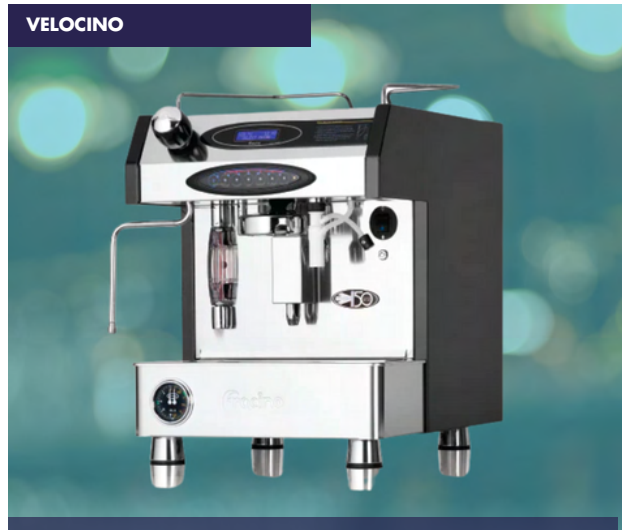
Hybrid espresso machine which pairs the convenience of a bean to cup machine, with the simplicity of a traditional espresso machine.