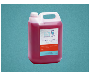
RINSE CLEAR RINSE AID For use in glass & dish washers 5L

CRYSTAL CLEAR GLASS WASHER DETERGENT For use in glass washers 5L