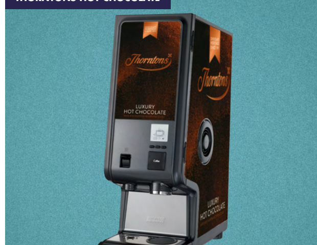
These easy to use machines are specially calibrated to produce delicious, smooth and velvety hot chocolate from the Thorntons powder.