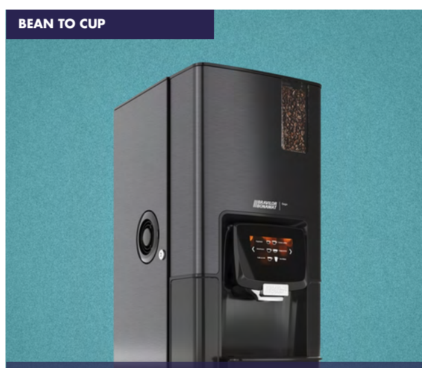
Barista quality coffee at the touch of a button Offer a range of premium drinks including cappuccinos, lattes and more!

Increase your weekly profits by offering both sit in and take out hot drinks. Our coffee machines allow you to create delicious cappuccinos, mochas, lattes and more at the push of a button.