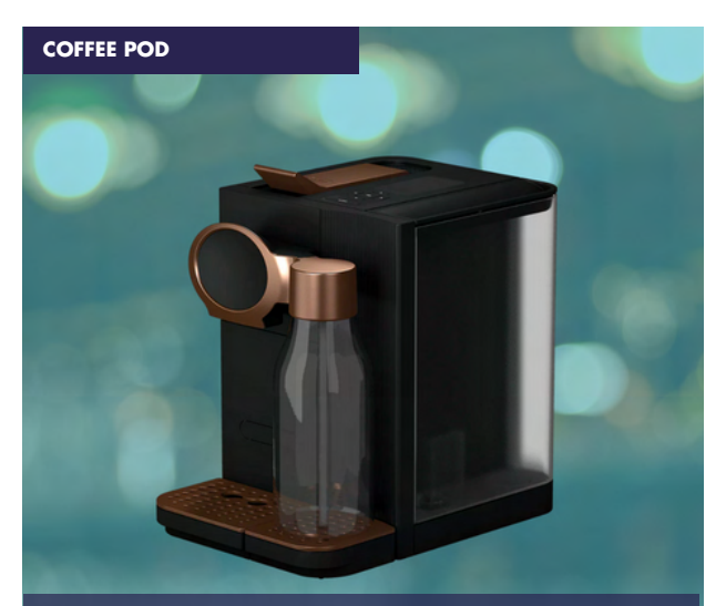
Coffee pod machines uses premium pods and fresh milk to easily create quality hot drinks for your customers.