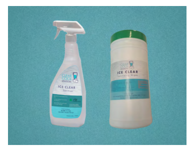
ICE CLEAR SANITISING SPRAY & WIPES For ice machines & bottle coolers 750ML / 200 wipes