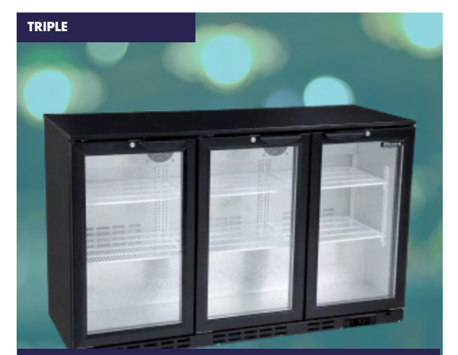
Hinged or sliding door Available in black or stainless steel 293 bottle capacity H x W x D - 895 x 1355 x 515 mm