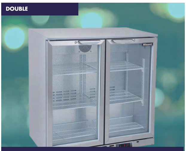
Hinged or sliding door Available in black or stainless steel 182 bottle capacity H x W x D - 895 x 905 x 515 mm