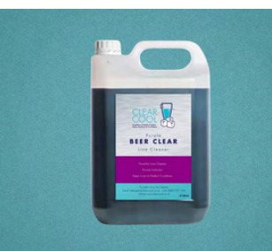
BEER CLEAR LINE CLEANER For use in your beer lines 5L