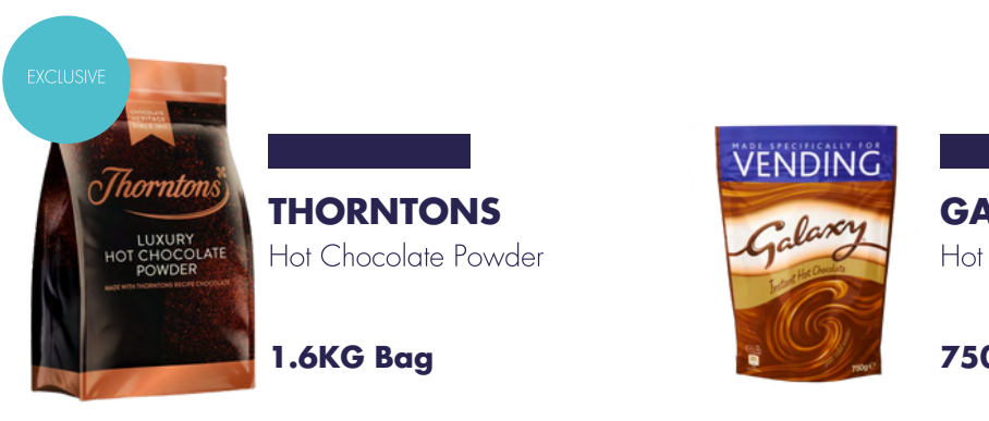
GALAXY Hot Chocolate Powder

Never run out of hot drink ingredients again! Order your quality consumables from us and we'll deliver them direct to your door.