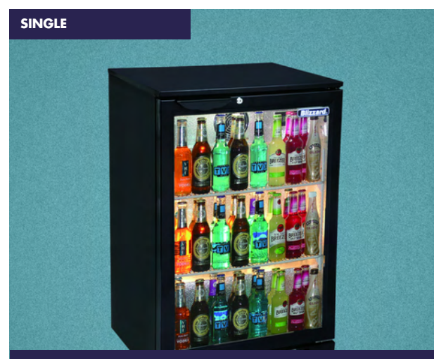
Hinged door Available in black or stainless steel 130 bottle capacity H x W x D - 895 x 600 x 515 mm

Our extensive range of bottle coolers come in a variety of sizes and can be provided as stainless steel or black finish. Double and triple coolers can also come with either hinged or sliding doors depending on your preference.