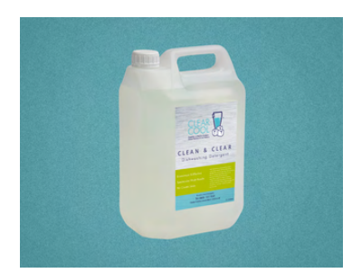
CLEAN & CLEAR DISH WASHER DETERGENT For use in dish washers 5L

Clear Cool are suppliers of quality detergent, sanitiser and line cleaner. All of our detergents are available to be purchased by calling 0800 7311 026 or visiting our website.