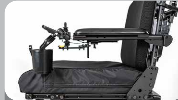
Coffee Cup Holder