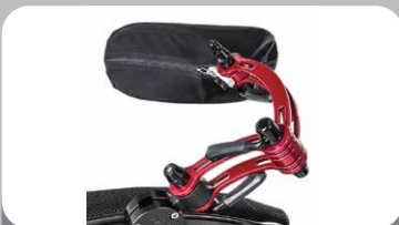
Colour Headrest Mount