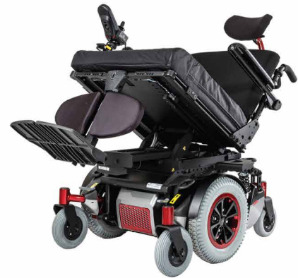
Heavy Duty Tilt