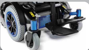
Independent height adjustable footplates