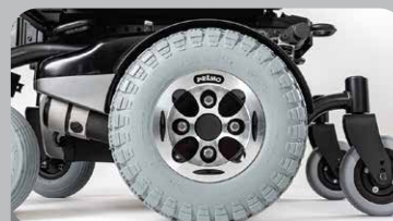
New Drive Wheel

Please see order forms for a complete list of options