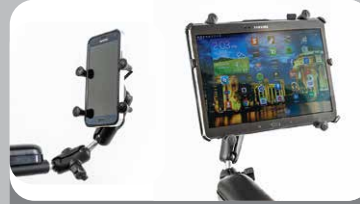
Phone & Tablet Support