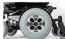
New Wheel option