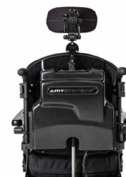
New Back Cover

The Quickie® Xplore 2™ is the most hybrid product available. This wheelchair offers the best of both worlds; the traction of a rear wheel drive and the short turning radius of a mid-wheel drive wheelchair. The fast speed of the Xplore 2™ makes it the ideal choice for someone spending a lot of time outdoors and who wants to go the distance. Safe and comfortable, the 6-wheel independent suspension is offered in Standard and Heavy Duty. The wheelchair come standard with transport brackets. Seat options: tilt, manual and power recline, and elevating seat.