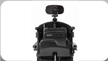
New Back Cover