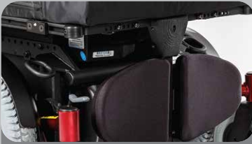
Infinite adjustment center mount -5^{\circ} to 70^{\circ}