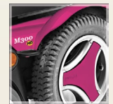
POP STAR PINK