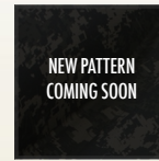
DIGITAL ARMY CAMO