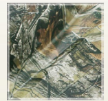
REALTREE AP CAMO