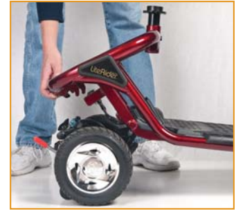
While squeezing the release lever, pull up on the rear frame