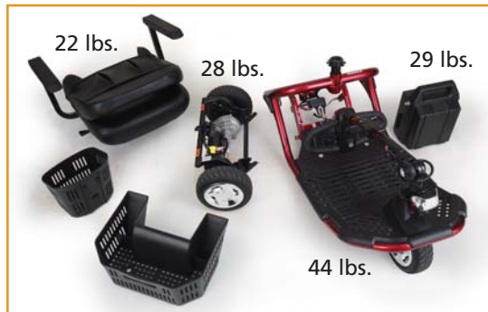
Disassembles into six pieces for transport and storage! No wires to connect or disconnect!