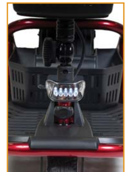
Brand new LED ultra bright adjustable headlight