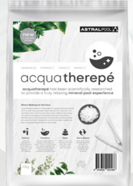
Acquatherepé 10kg bag