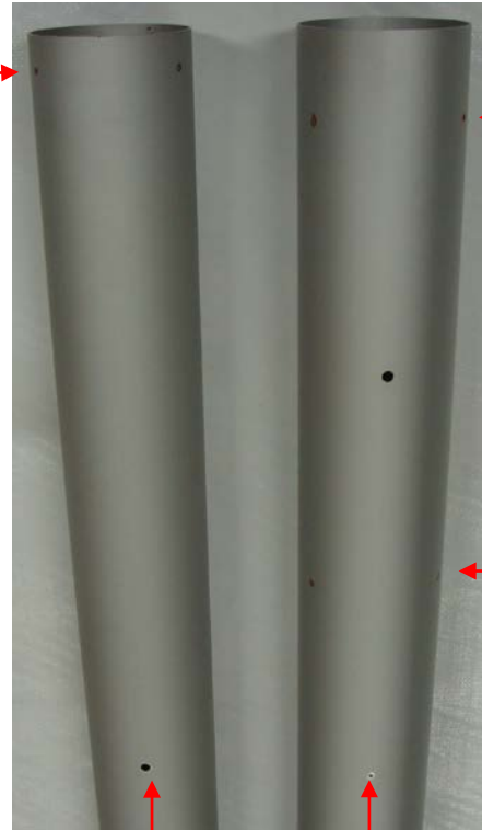
Feather plug hole lines marked White