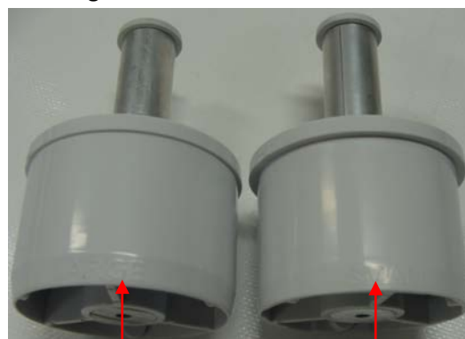
LARGE End Slug Marking

Note where the markings are on the end slug before installation: