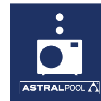
HEATPUMPGO SMART APP CONTROL

* Wifi capability included in Viron Inverter and Top Discharge Heat Pump range. Available as an optional add-on ECO models.