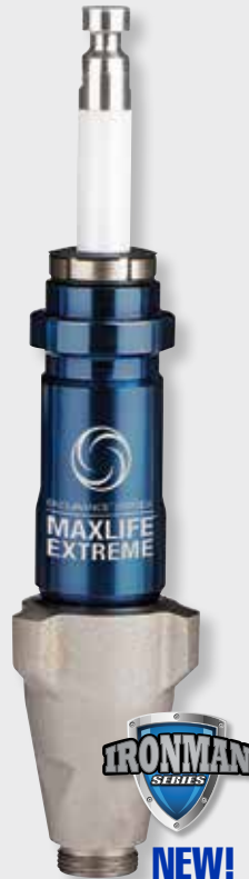
Endurance Vortex MaxLife Extreme Pump for GMAX Extends pump rod life by 3X—delivering the industry's lowest cost of ownership NEW!