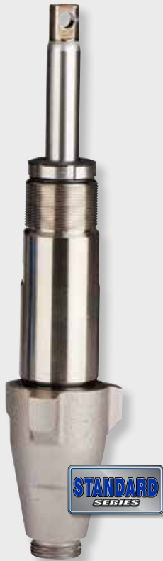
Endurance Chromex™ Pump for GMAX Lasts 2X longer than competing pumps