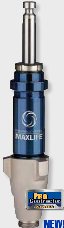
Endurance Vortex MaxLife Pump for GMAX 6X longer between repacks NEW!