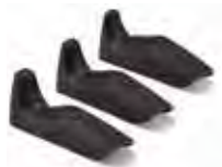
3 Grip Sizes Available