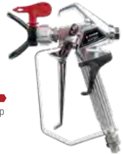
RX-80 Gun with 4-Finger & TR 1 Tip