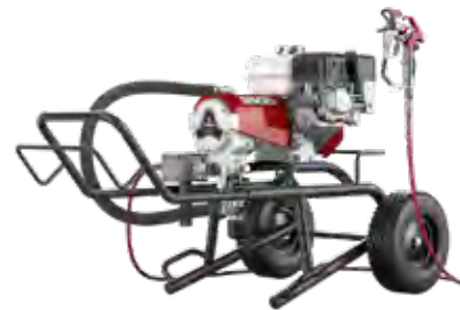
▶ Elite 3500 Low Rider