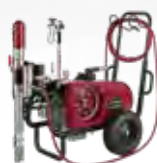
■ PowrTwin 6900 Plus DI Electric

Configured with a submersible foot valve designed for very heavy materials, including drywall mud.