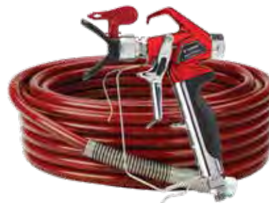
▶ The Elite 3500 comes complete with RX-Pro Gun, 517 TR1 Reversible Tip and 1/4" x 50' Airless Hose.