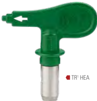
TR 1 HEA