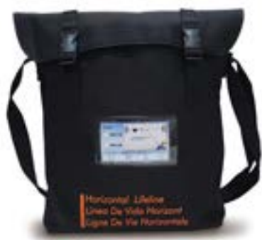
Includes special carrier bag with explanatory card