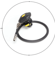
Quick-coupling Demand Valve