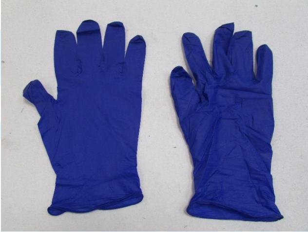
Gloves described as PFN Powder Free Nitrile Gloves, Non-Sterile - indigo