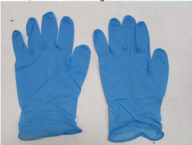
Gloves described as PFN Powder Free Nitrile Gloves, Non-Sterile - blue