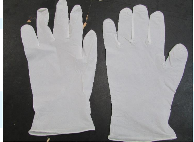
Gloves described as PFN Powder Free Nitrile Gloves, Non-Sterile - white