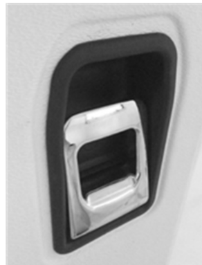
To lock and unlock door from inside, simply push or pull handle.