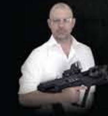
TAMIR PORAT WORLD RENOWNED ISRAELI WEAPONS DESIGNER

RECOVER PRODUCTS ARE DESIGNED BY WORLD RENOWNED ISRAELI WEAPONS DESIGNER TAMIR PORAT. TAMIR HAS MORE THAN 20 YEARS OF EXPERIENCE IN DESIGNING INNOVATIVE WEAPONS SYSTEMS INCLUDING THE TAVOR ASSAULT RIFLE USED BY THE ISRAELI DEFENSE FORCES.