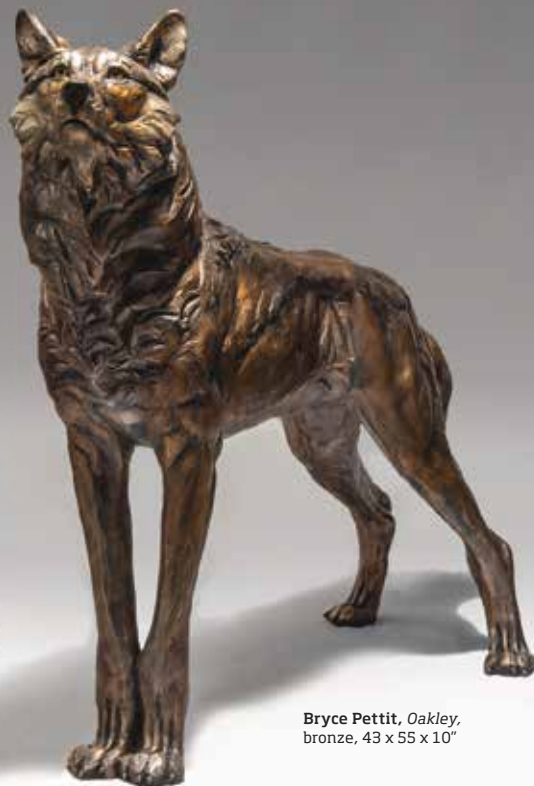
Bryce Pettit, Oakley, bronze, 43 x 55 x 10"