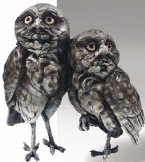
Bryce Pettit, The Odd Couple, bronze, 9 x 9"

Sroka is mostly a self-taught artist and had