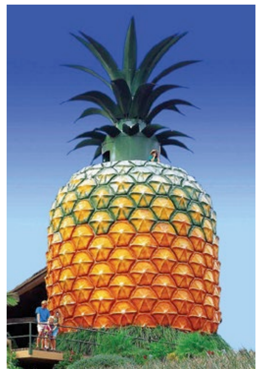
The Big Pineapple