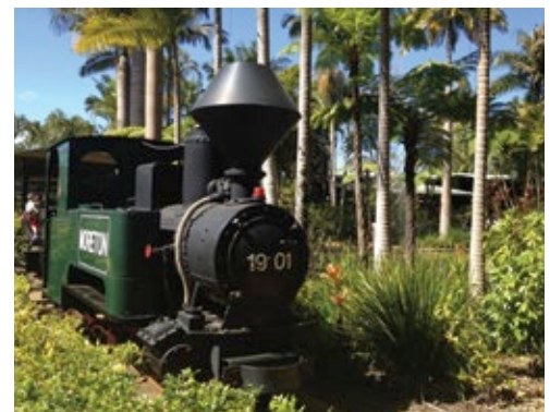
The Ginger Factory

Note: these listings are only suggestions and there are many other attractions in the area. To view other options you can look at various websites such as www.tourismsunshinecoast.com.au or www.queensland.com/Explore-Queensland/Sunshine-Coast .