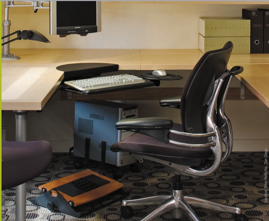
Location: Brian Reilly Inc., San Diego

A highly ergonomic work environment is built around four primary tools—task chair, articulating keyboard/mouse support, adjustable monitor arm and task light—that work together to improve the health and comfort of computer users. The absence of any one of these four tools may impact the ergonomic benefits of the others, whereas additional components, such as foot rests, can further improve the workstation's ergonomics. To better understand how the ergonomics leader can dramatically improve your workday with the right assessments, tools and training, contact your Humanscale representative.