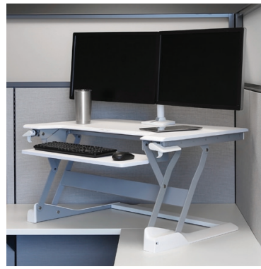
SHOWN WITH WORKFIT-TL SIT-STAND WORKSTATION

EACH MONITOR HAS INDIVIDUAL UP/DOWN TILT