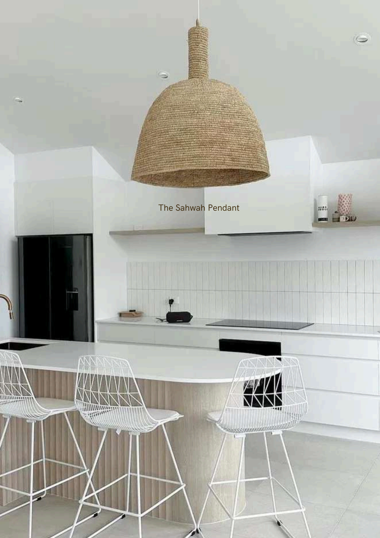
The Sahwah Pendant