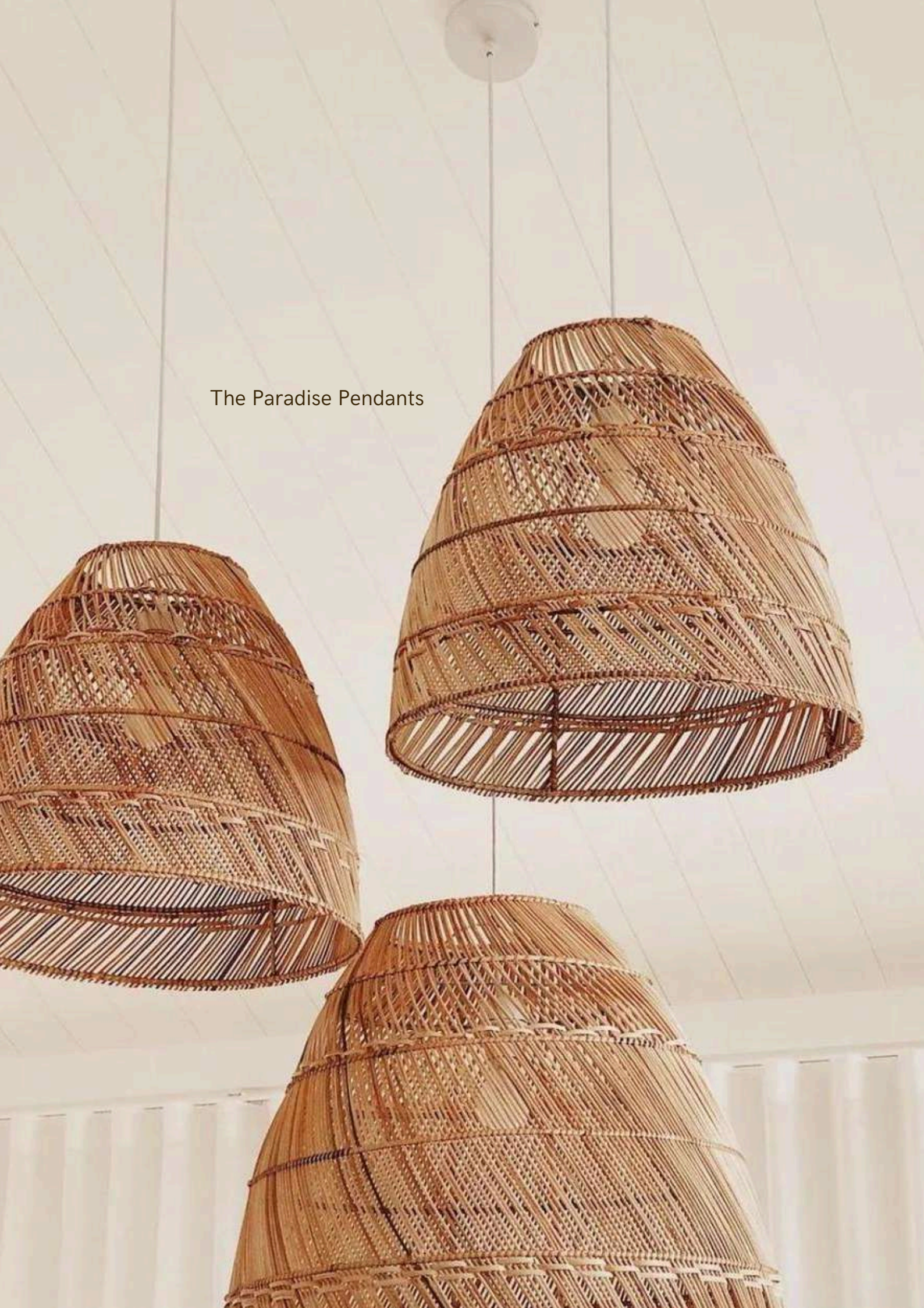
The Paradise Pendants