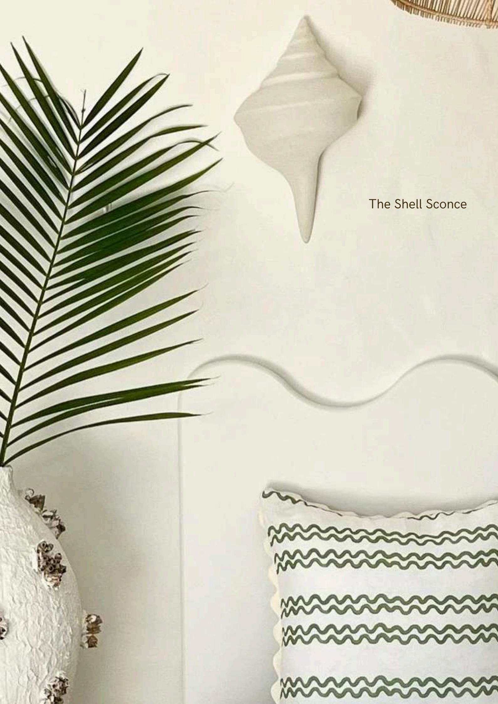
The Shell Sconce