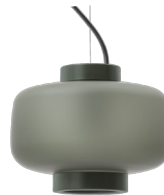
Large Matte Smoked