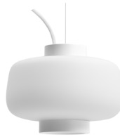
Large Matte Ivory