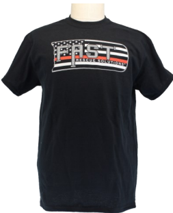
FAST Thin Red Line T-Shirt