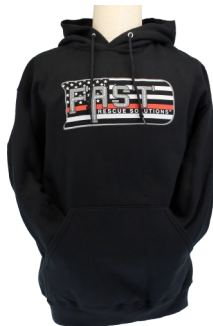
FAST Thin Red Line Hoodie