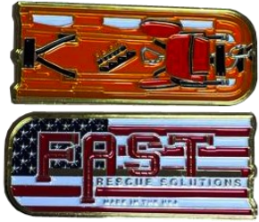
FAST Board Challenge Coin