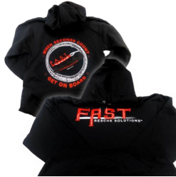
FAST Logo Hoodie