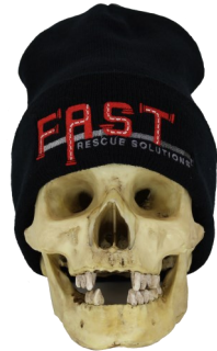
FAST Logo Beanie