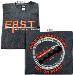
FAST Logo T-Shirt