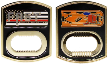
FRS Challenge Coin/Bottle Opener