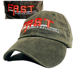
FAST Logo Hat