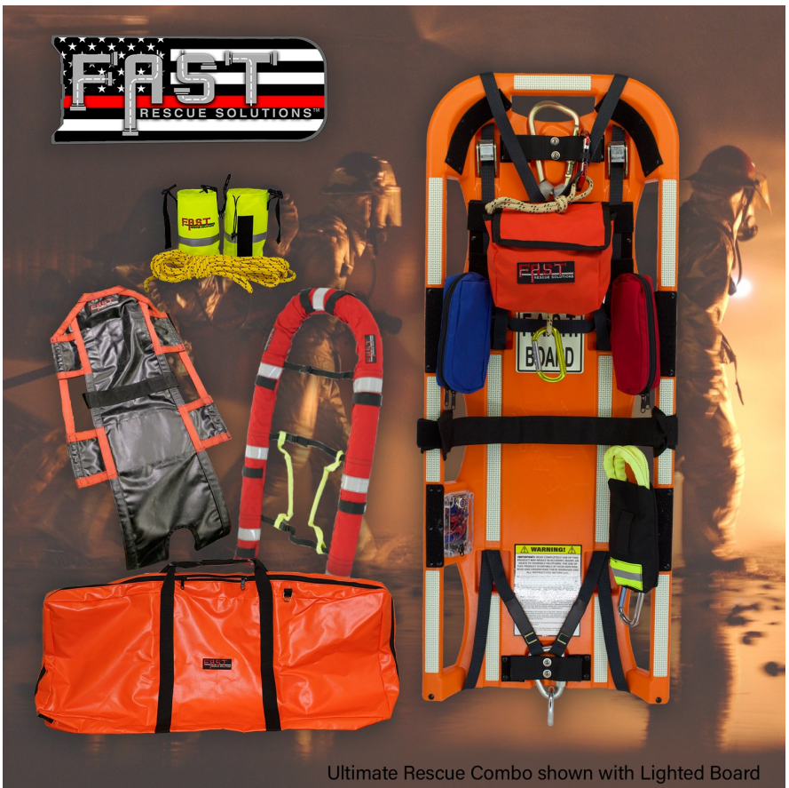
Ultimate Rescue Combo shown with Lighted Board