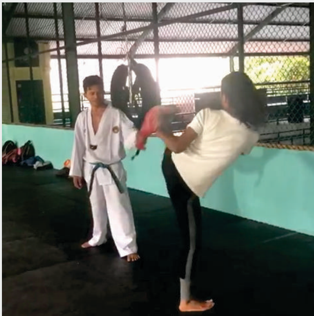
Our team took a Taekwondo self-defense class too!