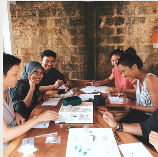
The fun continued with 2 design sessions where the team was invited to design their own jewelry