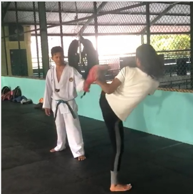
Our team took a Taekwondo self-defense class too!