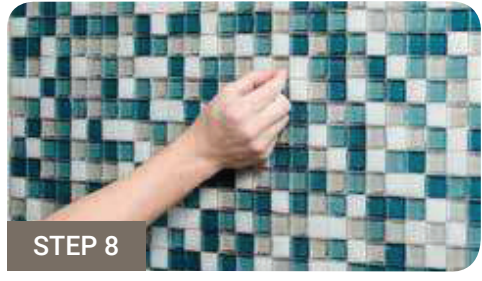
Straighten individual tiles and press-in any pieces that have not achieved 100% contact. To eliminate the sheet pattern pay particular attention to sheet transitions.