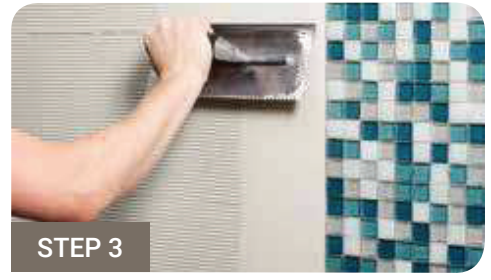
Use the flat side of the trowel to flatten the notches and achieve a smooth, consistent thin-set setting bed.