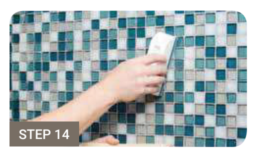
Apply sealer with spray bottle, paint brush or sponge applicator.