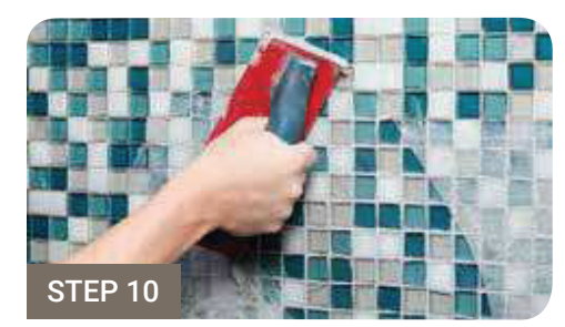
Grout application and cleaning process will vary based on the type and brand of grout. Refer to grout manufacturer's instructions for details.