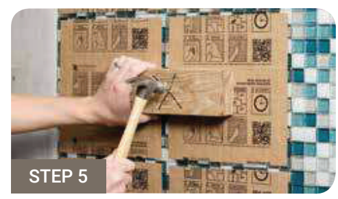
To achieve the flattest possible surface, lightly tap the sheets with a wooden beating block and a finish hammer. To unify sheet transitions, tap from one sheet to the next.