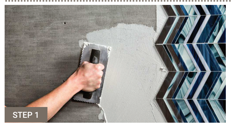
To initiate the bond coat, use the flat side of a trowel and firmly apply thin-set to the substrate.