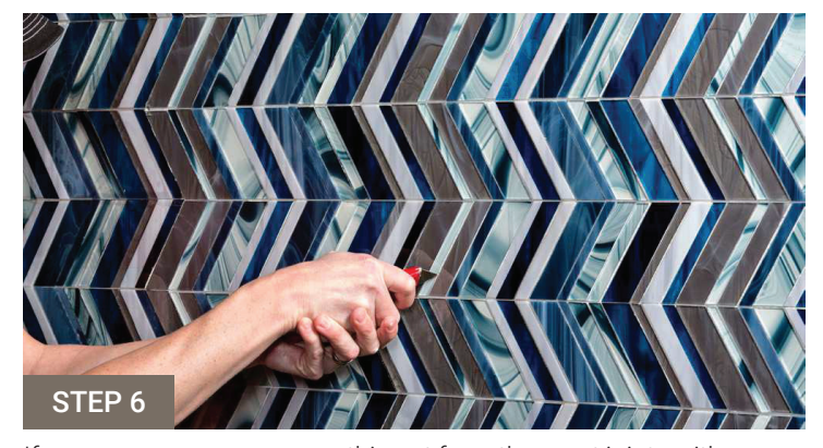
If necessary, remove excess thin-set from the grout joints with a razor knife prior to grouting.

NOTE: Grout application and cleaning process will vary based on the type and brand of grout. Refer to grout manufacturer's instructions for details.