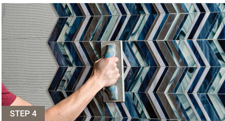
To achieve the flattest possible surface, lightly tap the sheets with a rubber grout float. Pay particular attention to the sheet-to-sheet intersections.