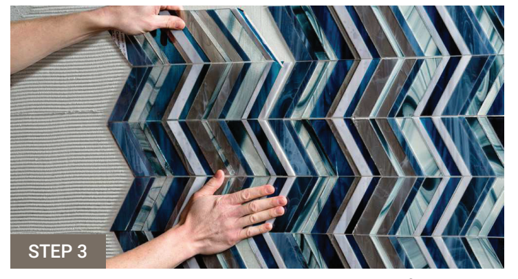
Apply mosaic sheets to the thin-set setting bed, plastic film side out, with light, even pressure. Periodically, check thin-set for skinning (slight drying). If skinning occurs, remove thin-set and reapply.