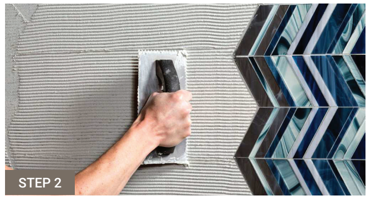
To establish the proper depth of the setting bed, use a 3/16" x 1/4" v-notch trowel to apply additional thinset and comb full notches in one direction.