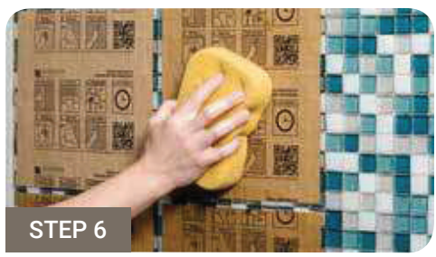
After 15-30 minutes, (floors can be removed sooner) lightly wet the paper. Keep the paper wet by wiping with a damp sponge several times over a 5-10 minute period. After the paper has absorbed the water, the glue will release.