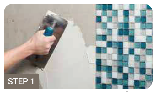
To initiate the bond coat, use the flat side of a trowel and firmly apply thin-set to the substrate

For mosaics with a side longer than 2", use a 1/4" x 1/4" square-notch trowel. For all other mosaic products, use a 3/16" x 1/4" v-notch trowel.