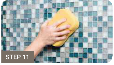
Allow grout to set-up (firm) and smooth finish with a damp sponge. After approximately 2 hours remove grout haze with a lightly damp sponge.