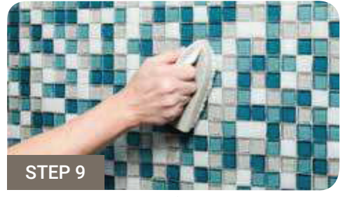
After a full 24 hours (some installations may require extended cure times) use water and a nylon scrub-brush to remove residual glue from the tile. Clean rinse and towel dry.