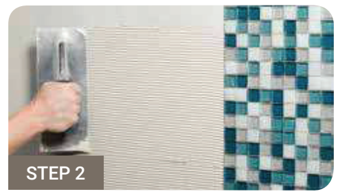
To establish the proper depth of the setting bed, use a notch trowel to apply additional thin-set and comb full notches in one direction.