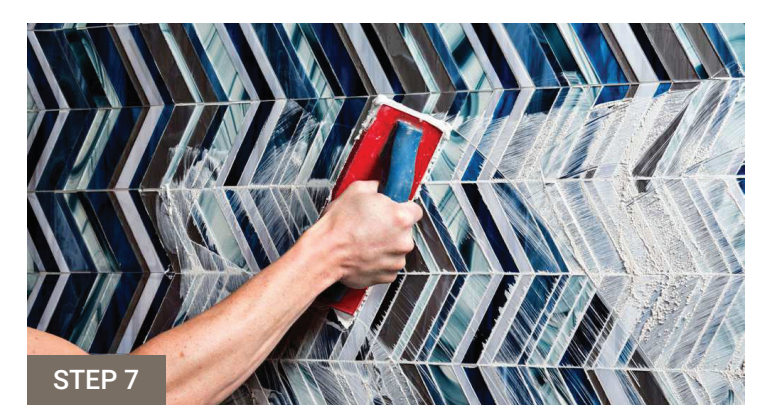
Apply grout per the grout manufacturer's instructions. When grouting with sanded grout, use care during application to minimize scratching.