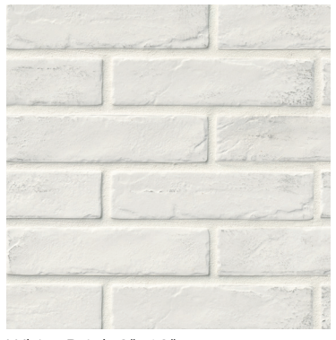
White Brick 2"x10"