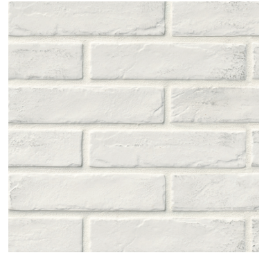
White Brick 2"x10"