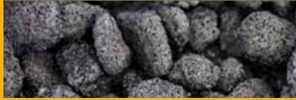
3/4" LAVA ROCK