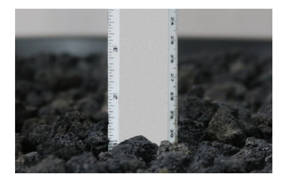
No more than 1" of burning media above the height of the burner. Adding more may cause damage