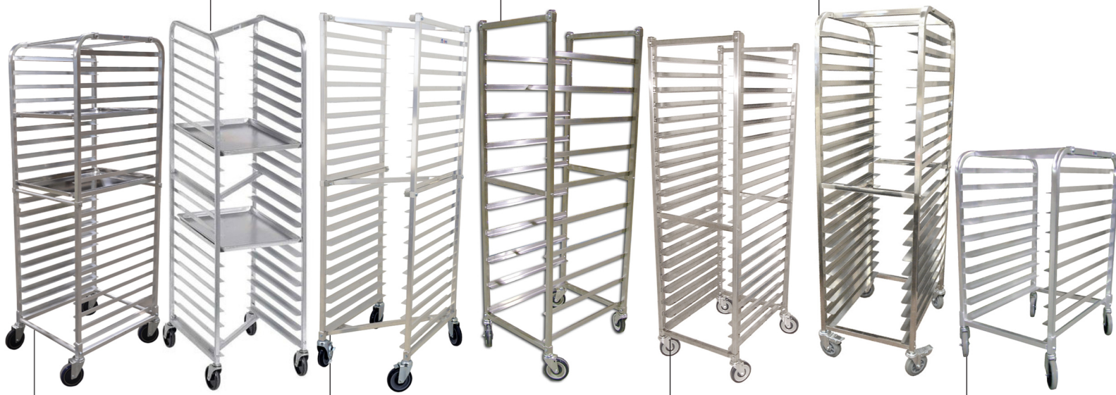
Item 23828 Aluminum Pan Rack 20 slides Curve top