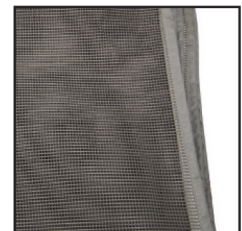
PVC Rubber Net Cover