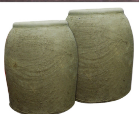
Extra clay for the clay pots