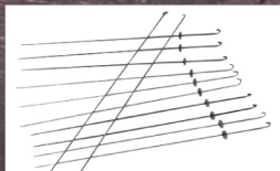
Skewers for cooking