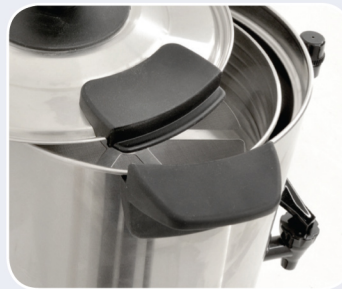
Locking Lid and Handles