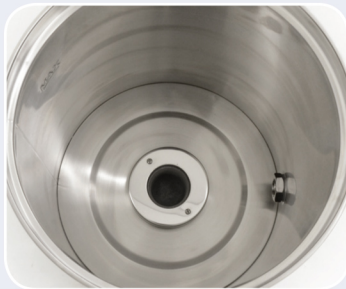
Stainless Steel Interior