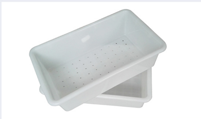
PLASTIC MARINATOR FILLING AND STORE SALVER