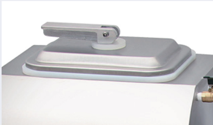
VACUUM SEAL LID