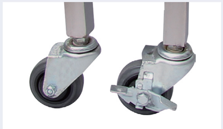
4 UNIVERSAL CASTERS (2 WITH LOCKS)