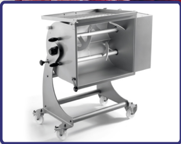
Removable Mixing Arms