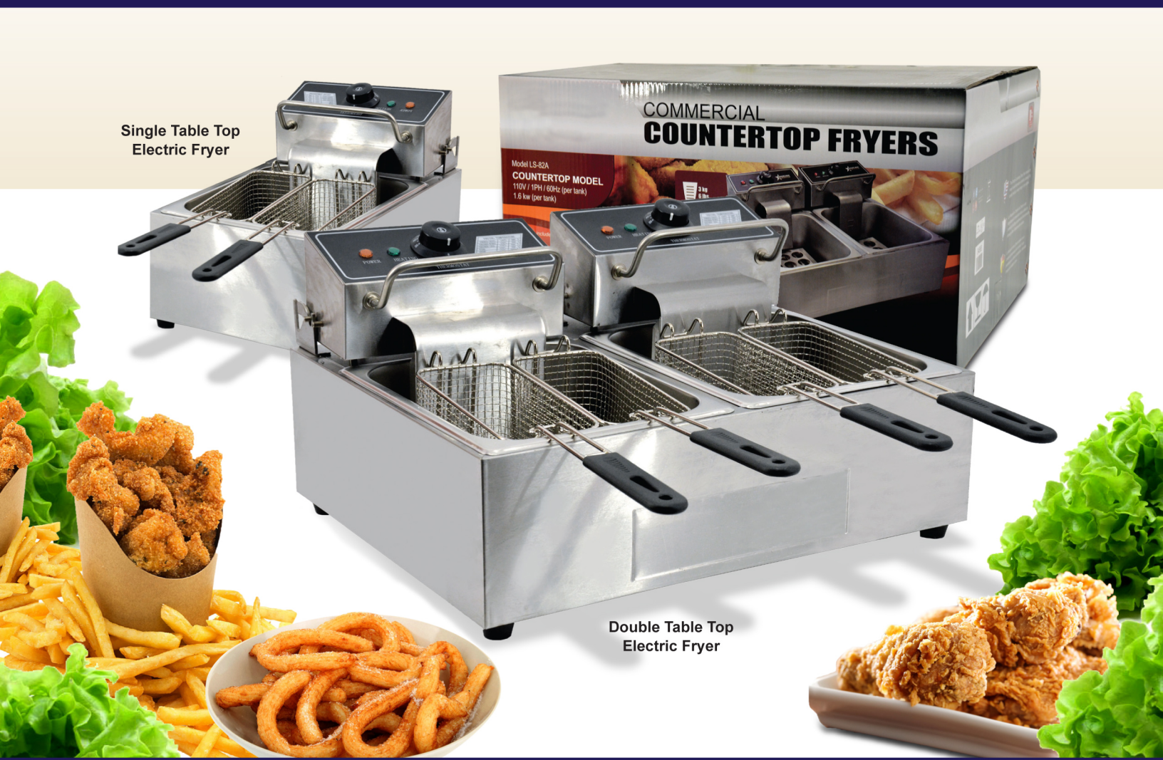
Single Table Top Electric Fryer

Model: CE-CN-0006 / CE-CN-0012 / CE-CN-0006-D / CE-CN-0012-D