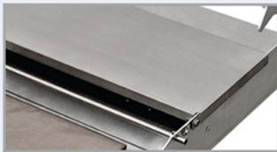
Tough aluminum and stainless steel construction

Our wrapping machines feature tough aluminum and stainless steel construction with an all-stainless wrapping surface for quick and easy clean up. Each wrapper is equipped with extra large rubber feet to prevent sliding on any counter surface. All models feature a solid state controlled hot rod cut off bar and standard size hot plate with a non-stick cover.