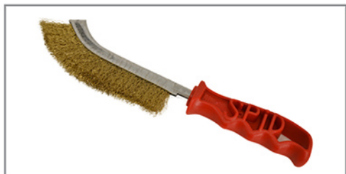
Panini Grill Cleaning Brush