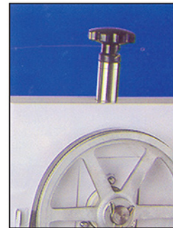
Blade Tension Regulator