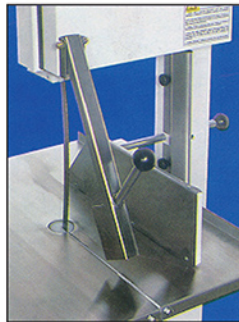
Pushing Lever + Gate